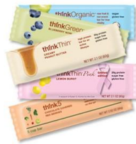
Female-Run Natural Nutrition Bar Company