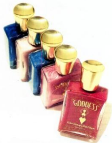
Women Create and Run Natural Nail Polish