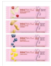
thinkThin Pink Natural Nutrition Bars to Benefit Susan G. Komen for the Cure