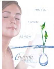
Functional Water Skin Remedy