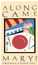
Female-Run Event Planning Company