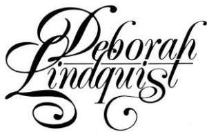
Recycled Cashmere Female Celebrity Eco-Designer